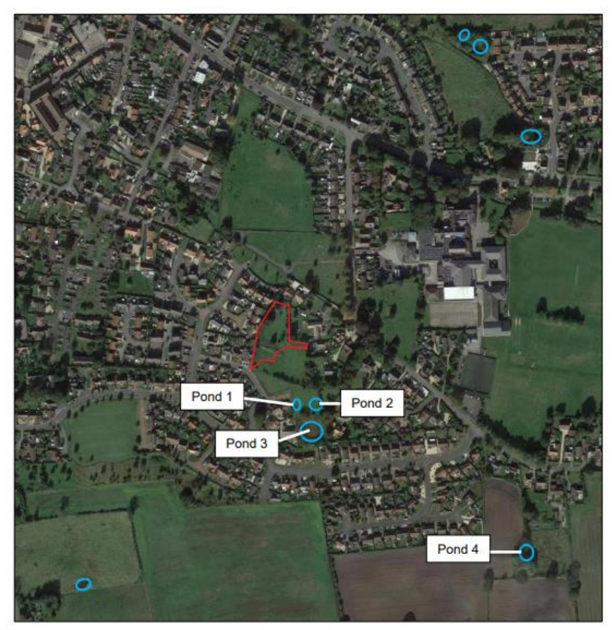
Figure 2: Locations of the eight ponds within 500m of the site

Figure 2 below shows the locations of the eight ponds within 500m of the survey site.